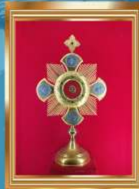
HOLY RELIC OF ST. THOMAS