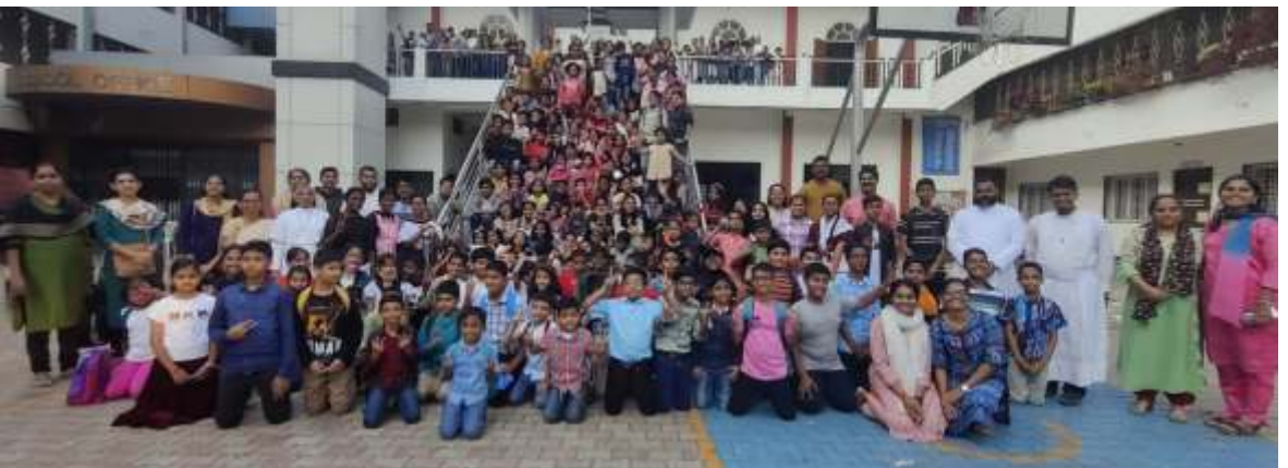
Pune Forane Rejoice Retreat conducted at St. Alphonsa Church, Kalewadi