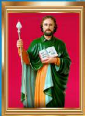
ST. THOMAS, PRAY FOR US

WITH IMMENSE JOY, WE, THE MEMBERS OF ST. THOMAS CATHEDRAL & PILGRIM CENTRE, INVITE YOU FOR THE FEAST CELEBRATION TO RECEIVE BLESSINGS AND INSPIRATION THROUGH THE INTERCESSION OF ST. THOMAS, THE APOSTLE.