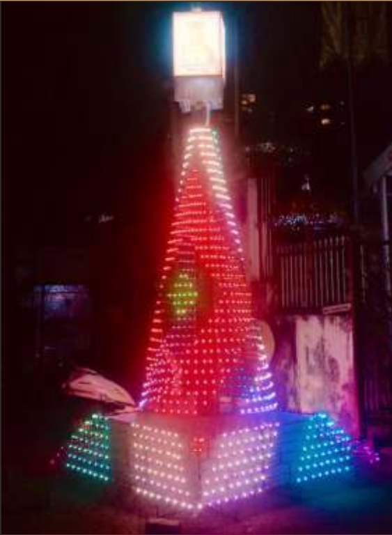
The tallest pindi and decorations at Christ the King Church, Bhandup, as part of St Sebastian's feast celebration during 15-24 January 2021.